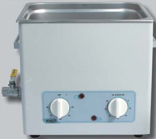
WUC-A06H with lid and valve