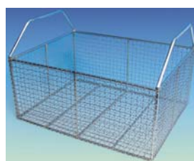
Stainless steel wire baskets for ultrasonic cleaner WUC-N

Note: no basket included, please order separately.