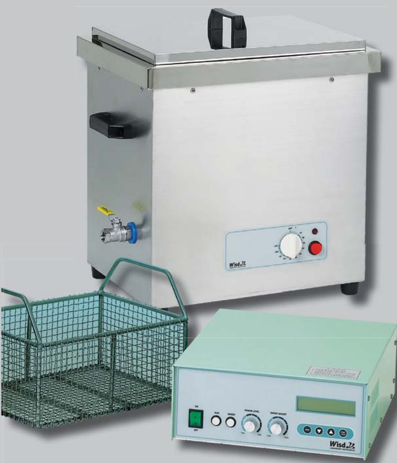
WUC-N47H with basket (not included) and remote controller

digital, with lid and external controller, 30 l - 74 l, HF frequency 40 kHz