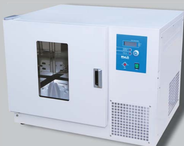
WIS-30 with universal platform (included)