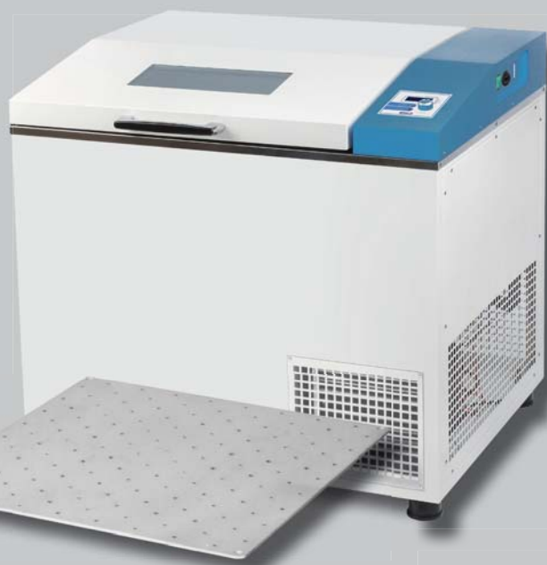
WIS-10 with universal platform (included)