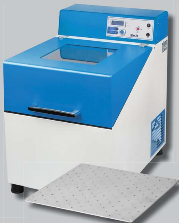
WIS-20 with universal platform (included)